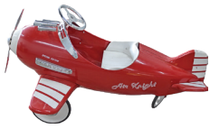
Vintage Pedal Cars