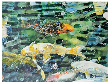
Joseph Raffael Watercolor 30" x 40"