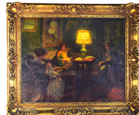
Arvid Nyholm Oil Painting 24.5" x 29.5"