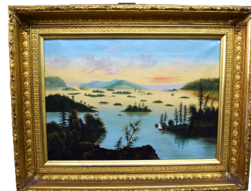
Attributed to Thomas Chambers 14" x 19.5"