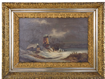
Dutch Winter Scene by Hollandse School 20" x 26"