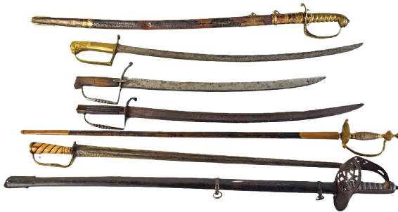
French and Indian War/Revolutionary War Swords