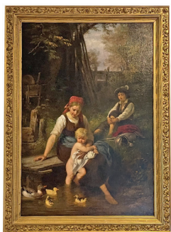
Rudolf Epp Genre Oil Painting 36" x 24"