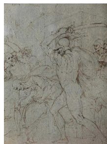
Benjamin West Drawing of the Death Of Cicero 11.5" x 9"