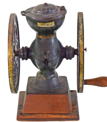
Early Coffee Mill