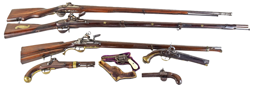
Collection of Early Weapons to include a Rare 1840 Harpers Ferry, Palmetto Pistol, Spanish Mexican War Musket and Pistol with Miquelet Locks, and Liege Pistols