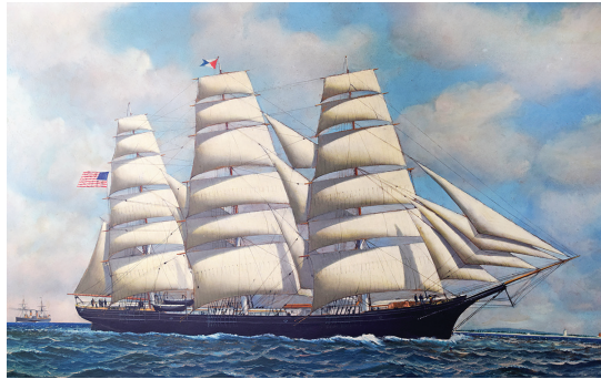
Antonio Jacobsen Painting of the Clipper Ship Flying Cloud 24.25" x 39"