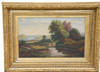
Providence RI School Likely Edward Mitchell Bannister 17" x 26"