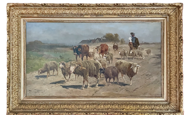
Gustav Ranzoni Oil Painting 22" x 42"