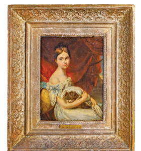
William Frith Portrait of His Oldest Daughter 16" x 19"