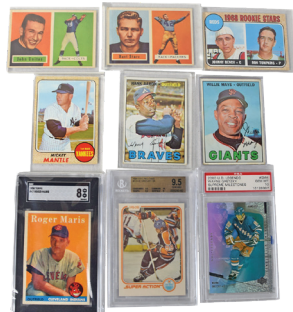
Large Collection of Sporting Cards