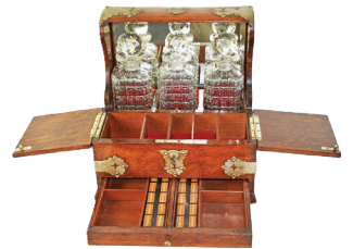
Tantalus Liquor Set